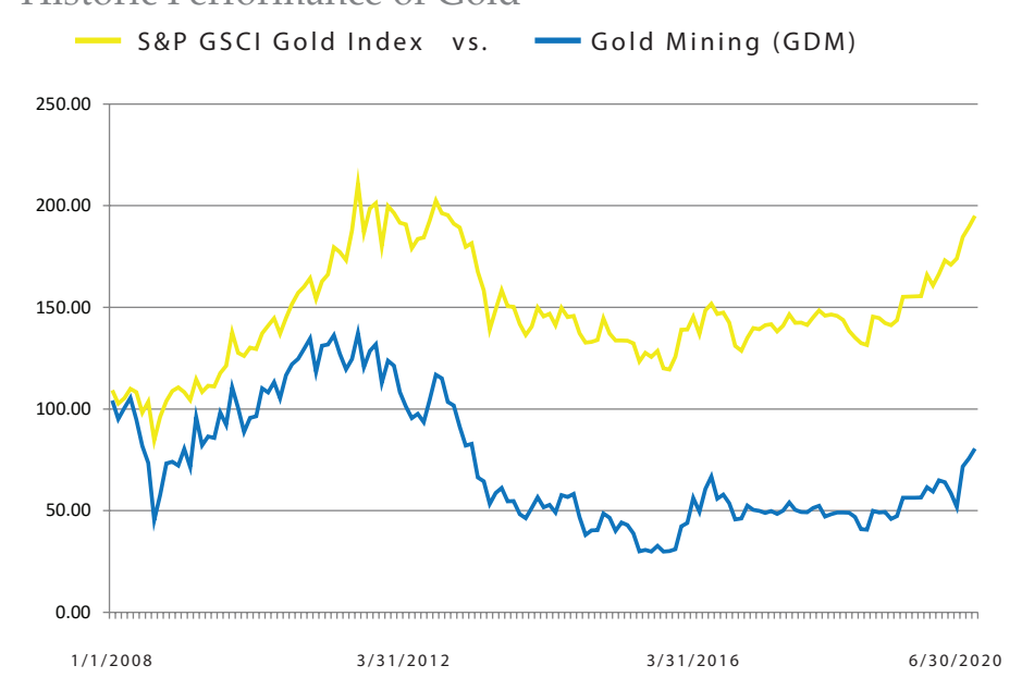
The S&P GSCI* Gold Index, a sub-index of the S&P GSCI, provides investors with a reliable and publicly available benchmark tracking the COMEX Gold future. This Gold Bullion index is shown for general Gold price comparison and is not meant to represent the performance of the Fund. The GDM is the symbol for the non-investable AMEX Gold Miners Stock Index.