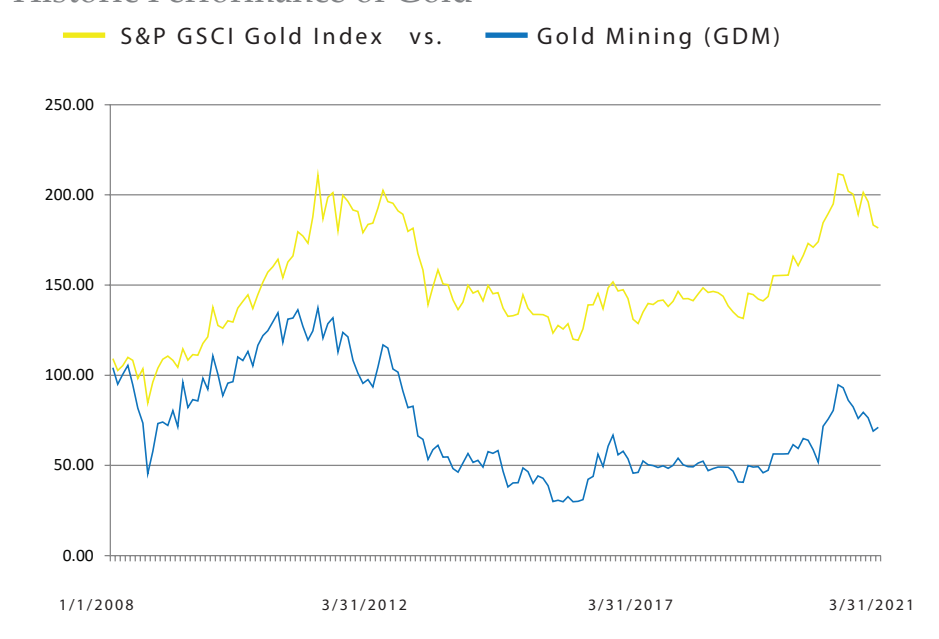
The S&P GSCI* Gold Index, a sub-index of the S&P GSCI, provides investors with a reliable and publicly available benchmark tracking the COMEX Gold future. This Gold Bullion index is shown for general Gold price comparison and is not meant to represent the performance of the Fund. The GDM is the symbol for the non-investable AMEX Gold Miners Stock Index.